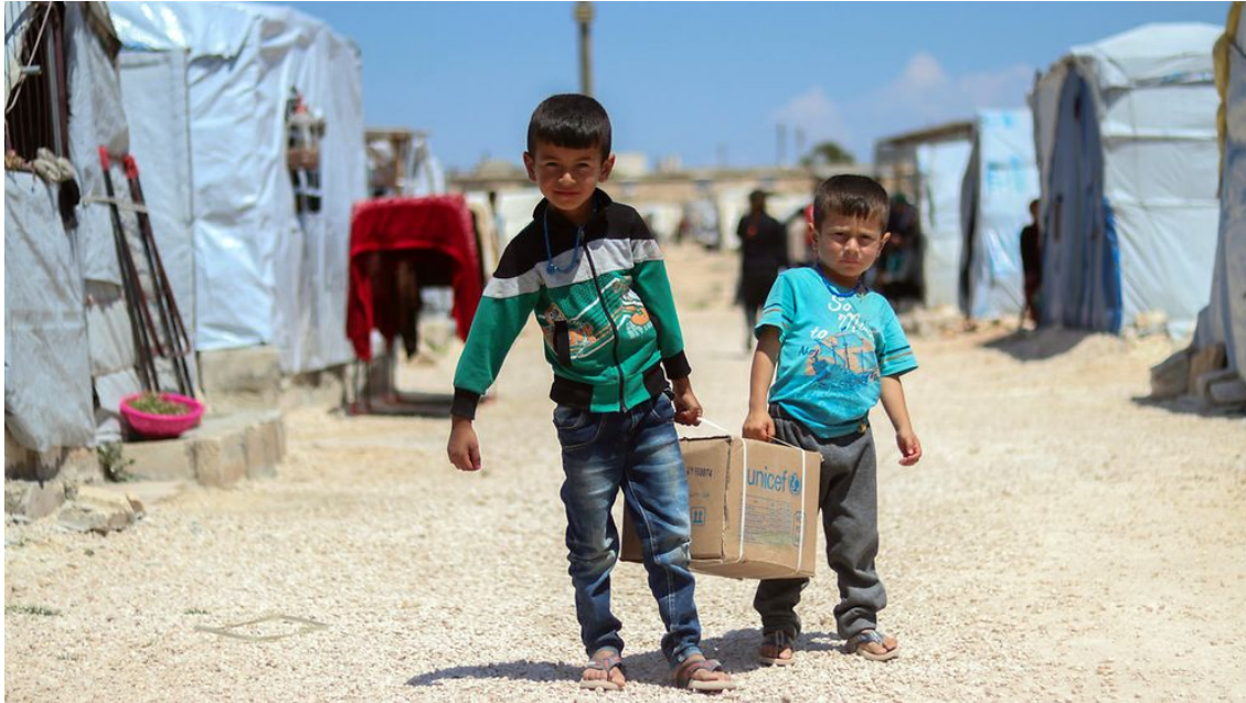
Two children carry a family hygiene package from UNICEF to their tent in Fafin camp near Aleppo/Syria.

If you are fooled by the idea of shortage caused by the allegations of resource depletion. This will justify the urge to take care of me and me before anyone else. It leads to jealousy, anger, violence, and a world where it seems like there is not enough.