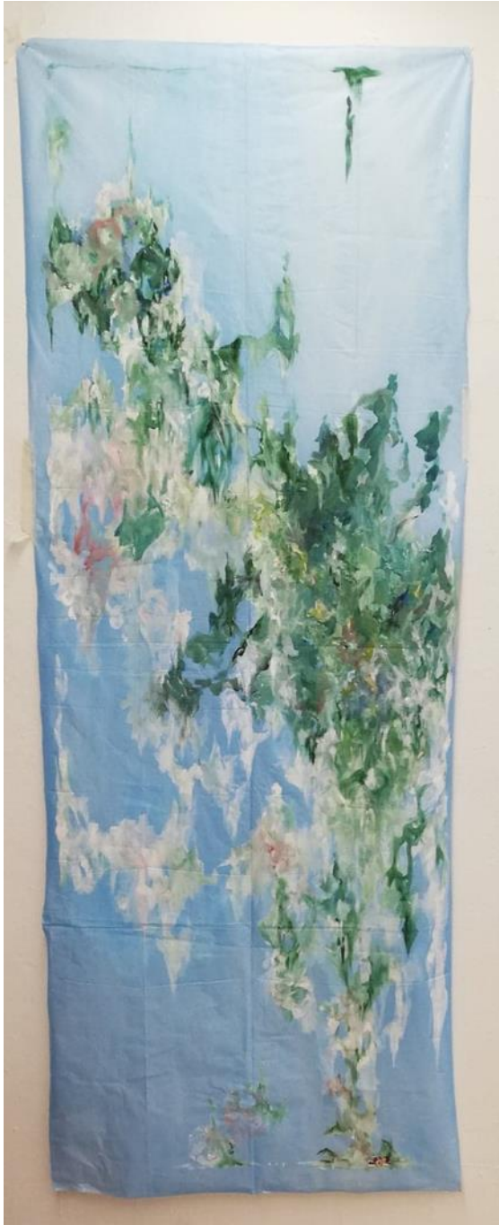
Quick painting/sketch/ colour study