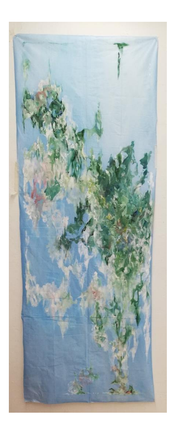
Quick painting/sketch/ colour study