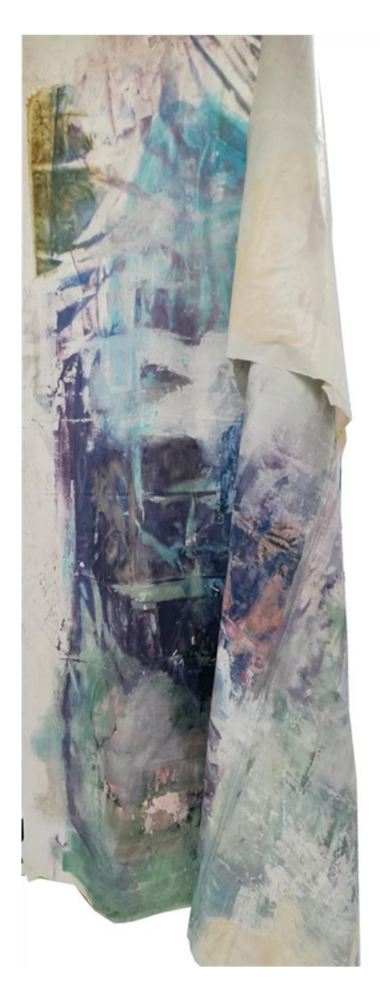
Just a material study